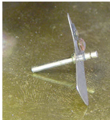
The broken fork arbour