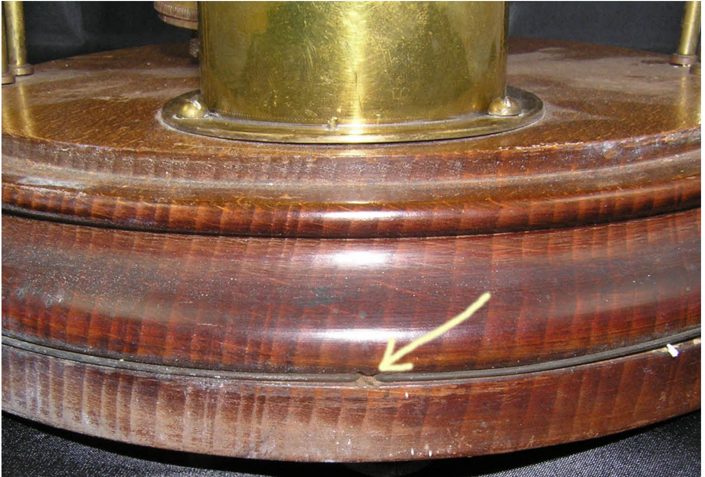
The photo above shows the hole where the decorative brass band is secured on the base.